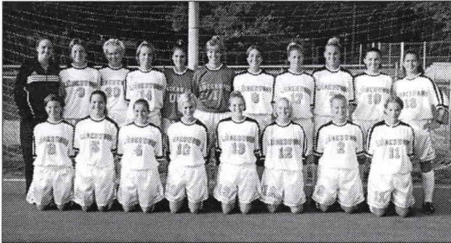
After another strong season, the women’s varsity soccer team traveled to Mobile, Ala., for the national tournament draw last weekend and will play its first game Tuesday.

• Fresh from their domination of the HAAC Championships on Nov. 7, the men’s and women’s cross country teams ran at nationals Saturday at the University of Wisconsin-Parkside in Kenosha,