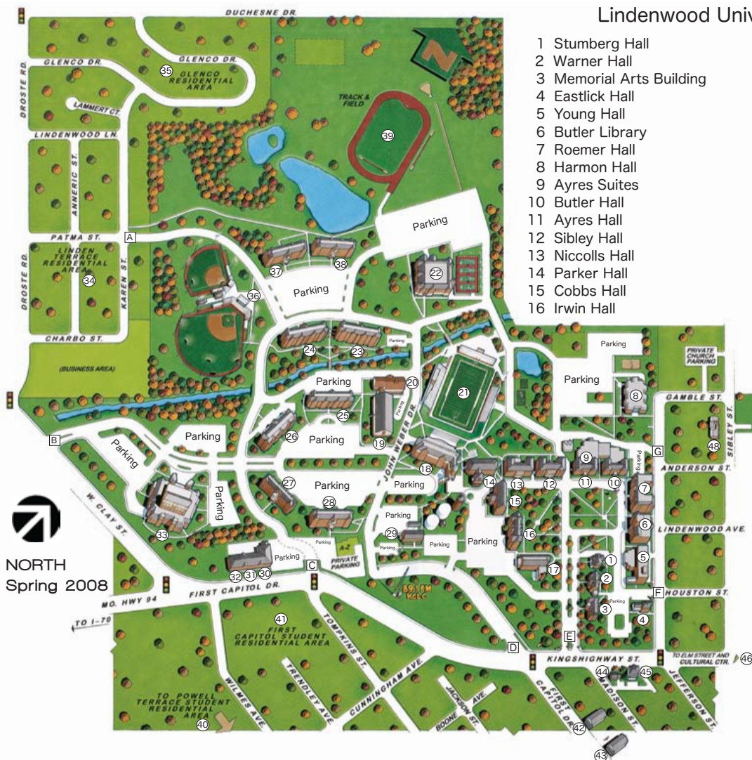
Lindenwood University Campus Map