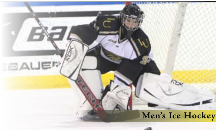
Men's Ice Hockey

The Lindenwood men's ice hockey and men's volleyball programs have been at the door of a national championship in the past but have always found themselves locked out from their ultimate prize. That changed this semester as both teams found the keys and claimed the first national title in their programs' histories.