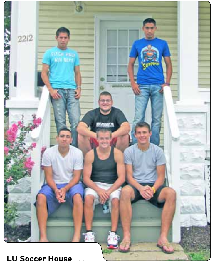
LU Soccer House . . .