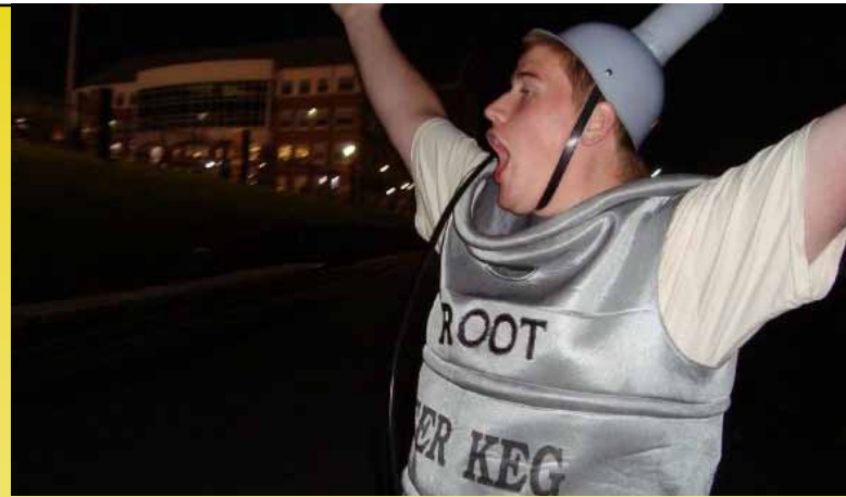
Activities, like the popular Rootbeer Kegger, will be in abundance in 2010