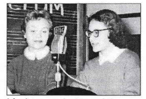
Lindenwood entered the world of broadcasting in 1948 with the launch of a carrier current AM station.

There will be seminars for students in most fields of study, so be sure to look for the