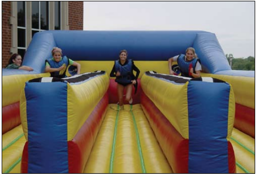
Fall Festival features a large selection of games and activities, including the ever-popular Bungee Run.

Parent's Day gives parents the opportunity to visit Lindenwood's