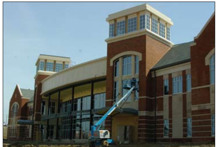
Construction on the Lindenwood Center began in 2005 and is expected to be completed this fall.

In addition to two performance venues and a secure gallery, the new center is the academic nexus for dance, graphic/computer