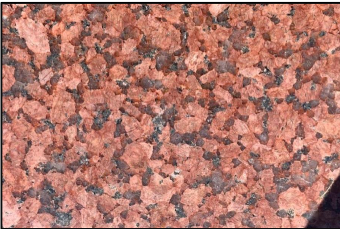
Granite: Red granite with felsic Orthoclase Feldspar (pink), and quartz.