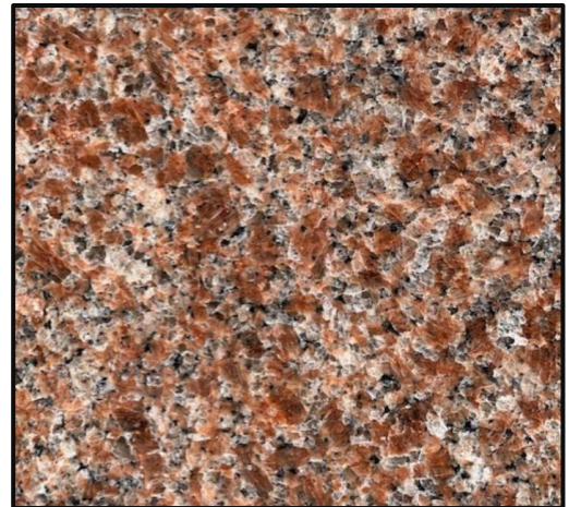
Granite: Red granite with pink orthoclase feldspar