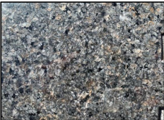
Granite with pink orthoclase feldspar