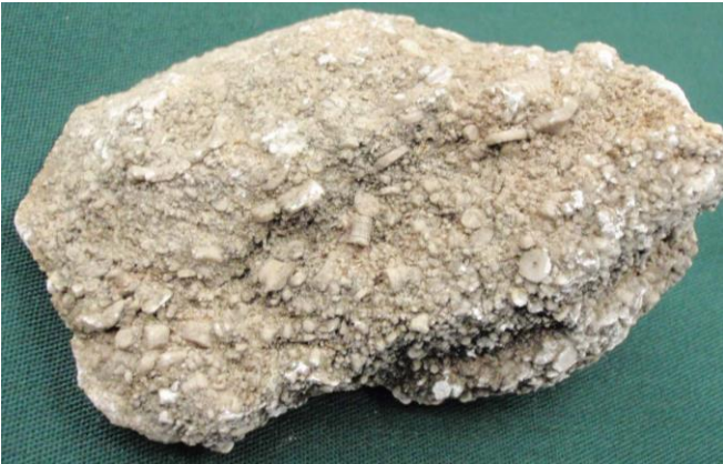
Calcarenite (fossiliferous limestone)

https://dnr.mo.gov/geology/geosrv/imac/limestone.htm