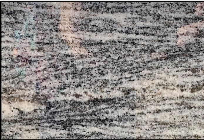
Gneiss: Characterized by compositional banding