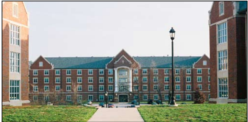
2008 saw the initiation of freshman residence halls and the addition of two new staff in housing.