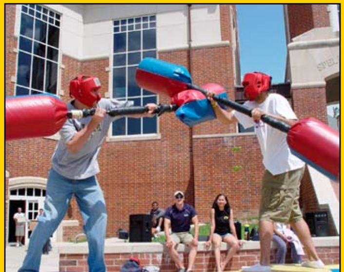
(top and bottom) Spring Festival 2008