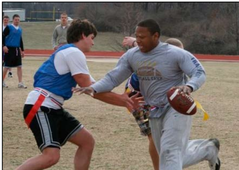
The popular flag football tournament will return on March 14, 2009, along with several new intramural sports opportunities.