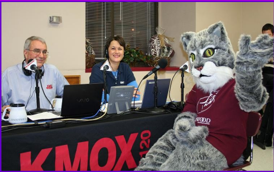
KMOX crew with the LU Lynx