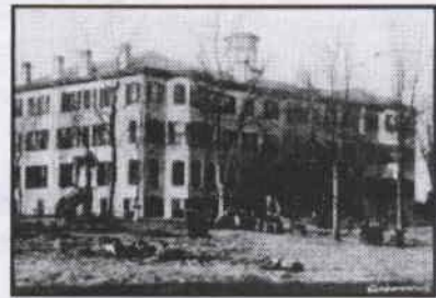
Sibley Hall—Built in 1856 as the first major building of the young and successful Lindenwood College