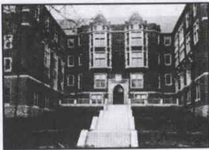
Roemer Hall—Constructed in 1922 to provide needed classroom and office space for growing and prospering Lindenwood College.