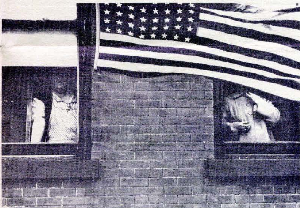
Hoboken 1955 by Robert Frank