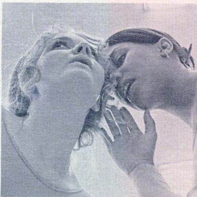
Dancers prepare to take the UNICORN on tour

Lindenwood's 16th President to be Installed April 26