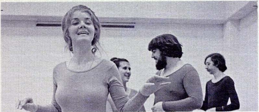
Dancers rehearse for the UNICORN

The Lindenwood Choir will perform the UNICORN on tour and in St. Charles as follows: April 3 at First Methodist Church in Illiopolis; April 5 at First Presbyterian Church in Springfield; and on April 5 at First Presbyterian Church in La Grange. These performances will be free and open to the public, as will the performances on April 12 and 13 in Jelkyl Center for the Performing Arts on the Lindenwood campus.