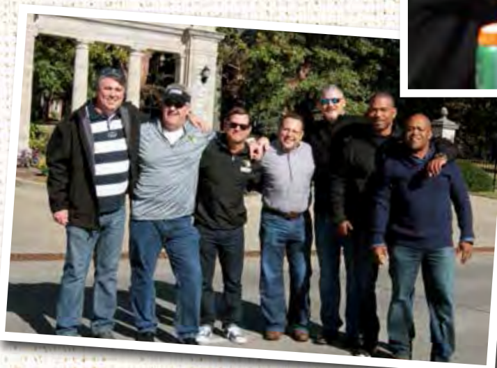
Members of Lindenwood's first-ever football team from 1989 marched in the Homecoming Parade Saturday and were inducted Saturday night into the Lindenwood Sports Hall of Fame. Their team received the inaugural Pioneer Award.