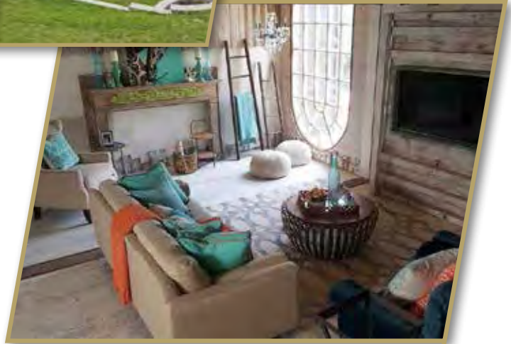
Unusual windows add flair to the living room area.