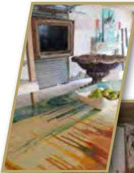
A large sculpture adorns the dining area.