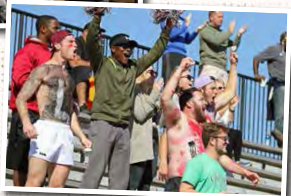
Lynx fans lined Lindenwood Stadium to cheer on the football team at the annual Homecoming football game.