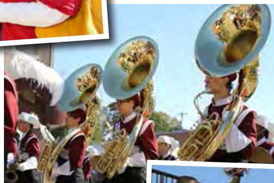
During the inaugural Homecoming Parade, more than 800 participants had a presence in the parade, including the Belleville West High School Marching Band.