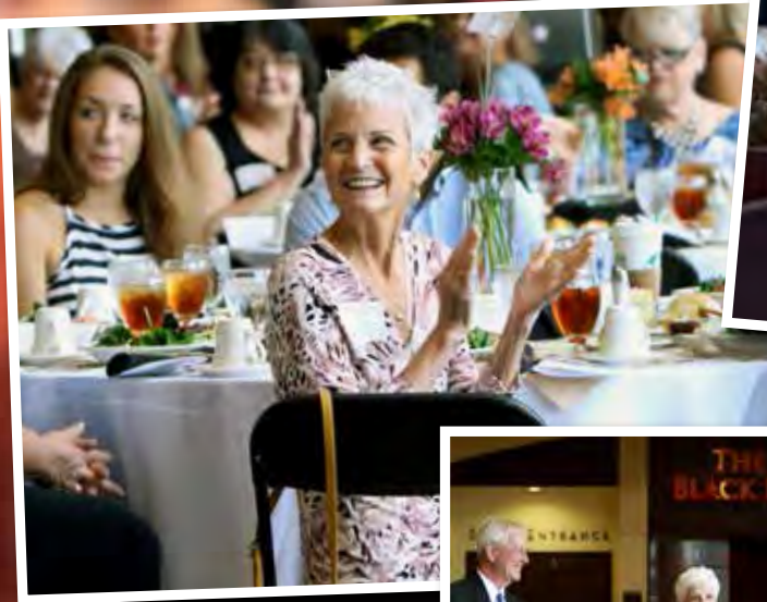
Lindenwood alumni and friends enjoying a performance by Voices Only, Lindenwood's acclaimed student vocal group.