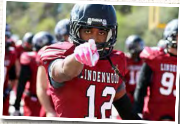
The Lynx Football team took on St. Francis University at the annual Homecoming football game on Oct. 22.