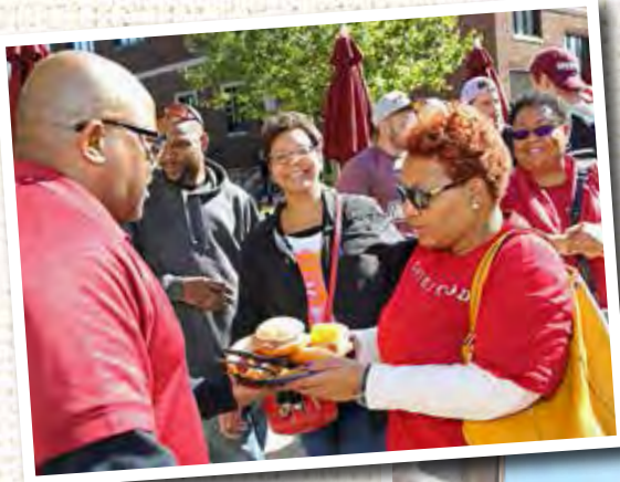
Parents, Family & Alumni Reunion Weekend at Homecoming 2016 was a huge success. Guests on campus enjoyed the Lynx Picnic, hosted by Pedestal Foods.