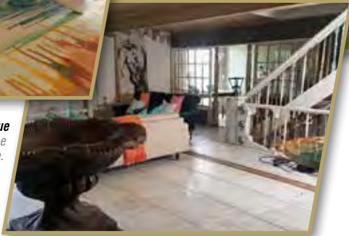
Unique spindles frame the staircase.