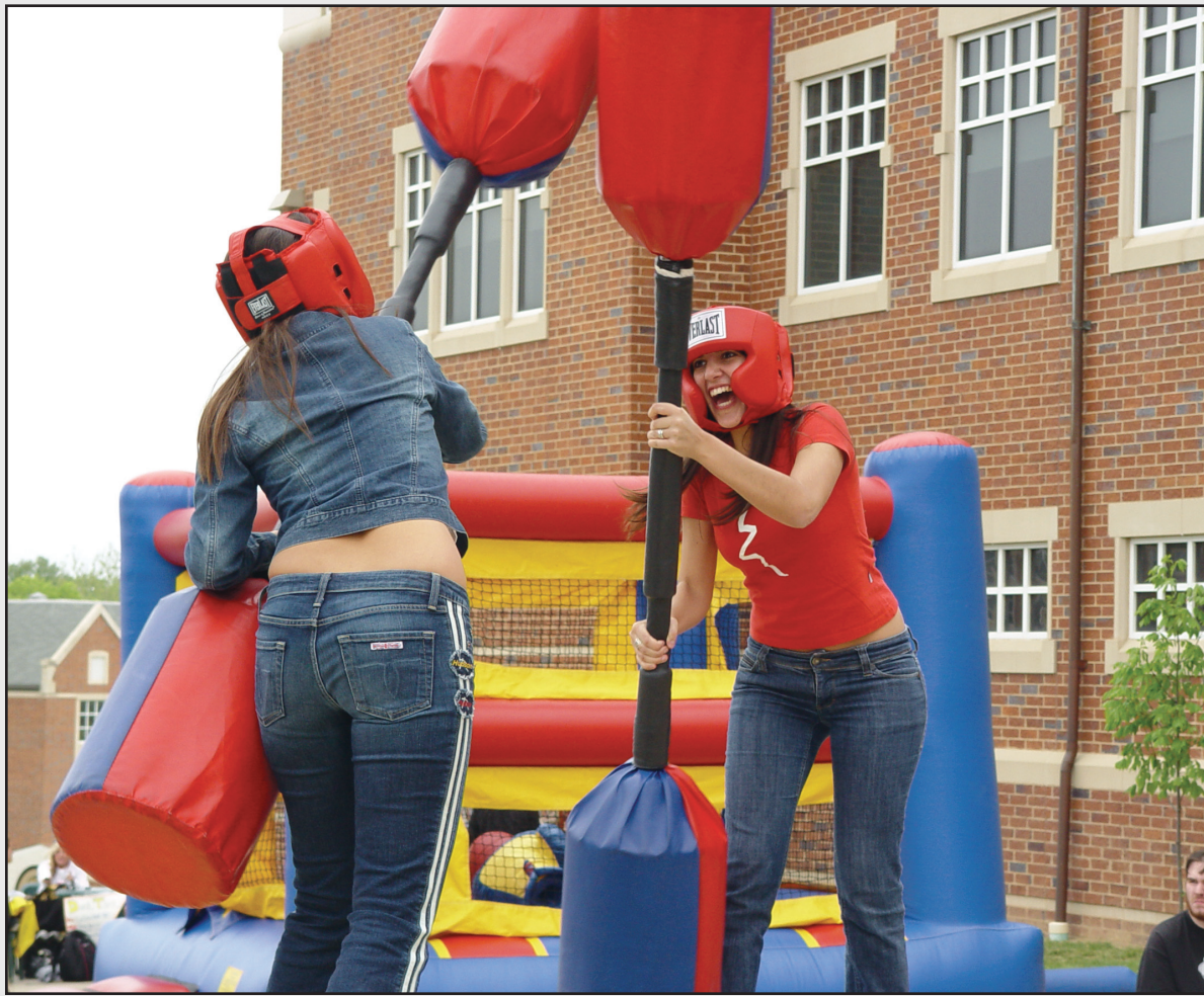
Lindenwood University students (above, below and bottom) enjoy Spring Fling activities in these file photos. This year’s Spring Fling runs April 20-29.