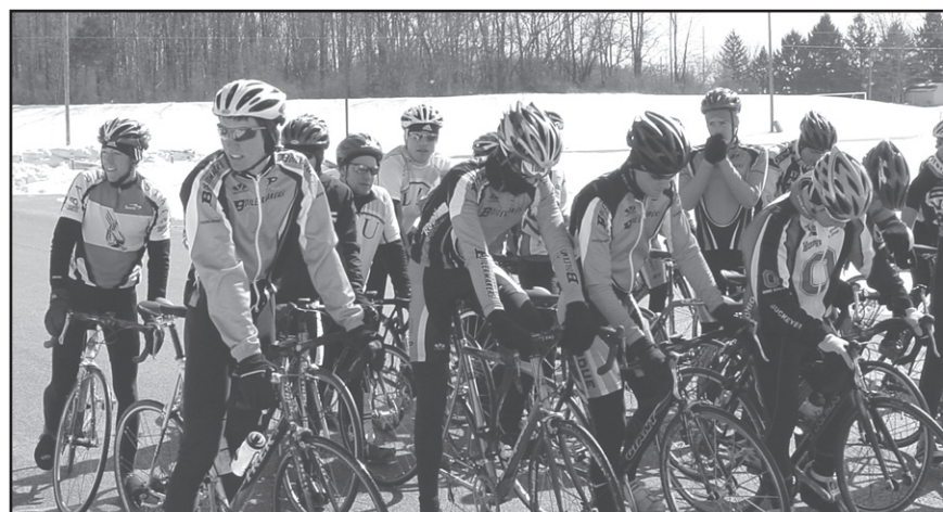
Members of the Lindenwood University Cycling team compete on March 4 in Crawfordsville, Ind. The club hopes to be an official university sport by next fall.

Tennis (W) Results Date, Opponent, Score March 16, Bethel, L 2-7 March 16, Tennessee Wesleyan, W 6-1 March 17, Cumberlands, Cancelled March 19, Evangel, W 9-0 March 21, St. Louis, Cancelled March 24, Illinois-Springfield, W 6-3 March 26, LeTourneau, W 9-0 March 26, Centenary, W 6-0 March 28, John Brown, W 9-0 March 29, Oklahoma Wesleyan, Cancelled March 30, Baker, W 7-1 March 31, William Jewell, W 7-2 April 1, Benedictine, W 5-4 April 3, SIU-Edwardsville, Cancelled April 5, McKendree, W 5-4 Upcoming Date, Time, Opponent April 9, Saint Louis, 3:30 p.m. April 10, Missouri Valley, 3:30 p.m. April 14, Graceland, 9 a.m. April 17, SIU-Edwardsville, 4 p.m. April 20, HAAC Tournament, TBD April 27, NAIA Region 5 Tournament, TBD May 14, NAIA National Championship, TBD