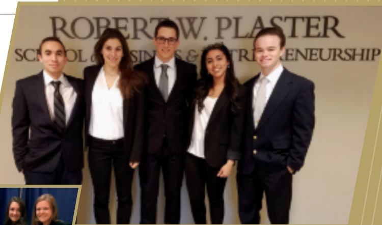
Robert W. Plaster School of Business & Entrepreneurship students