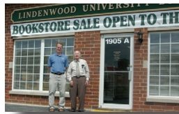
Spirit & Supplies Shoppe

8 a.m. - 6 p.m. (M - TR) 8 a.m. - 5 p.m. (F)