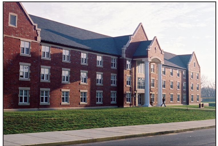
Plans were recently approved by the Lindenwood Board of Directors to build two new residence halls to accommodate residential population growth. The new buildings will be constructed in the style of the six that were built since 2000. See story, Page 2