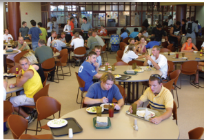
Spellmann Campus Center Café