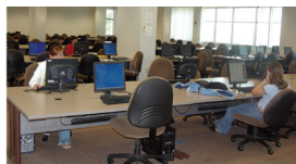
Spellmann Center Computer Lab

8 a.m. - 12 a.m. (M - TR) 8 a.m. - 5 p.m. (F) 8 a.m. - 4 p.m. (Sat.) 4 p.m. - 12 a.m. (Sun.)