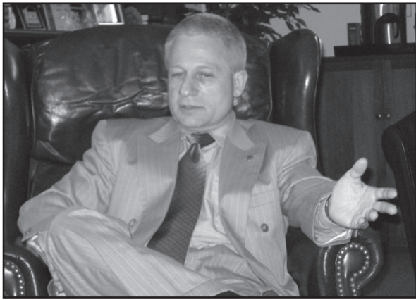
Legacy