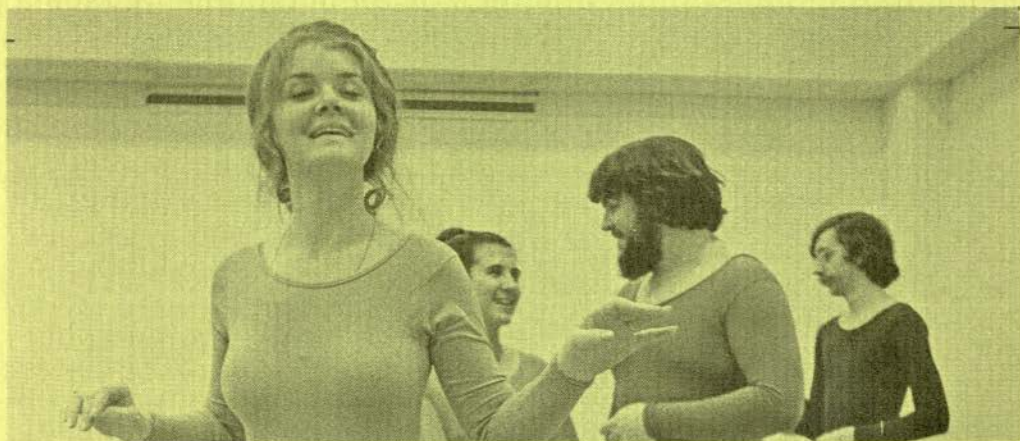
Dancers rehearse for the UNICORN

The Lindenwood Choir will perform the UNICORN on tour and in St. Charles as follows: April 3 at First Methodist Church in Illiopolis; April 5 at First Presbyterian Church in Springfield; and on April 5 at First Presbyterian Church in La Grange. These performances will be free and open to the public, as will the performances on April 12 and 13 in Jelkyl Center for the Performing Arts on the Lindenwood campus.