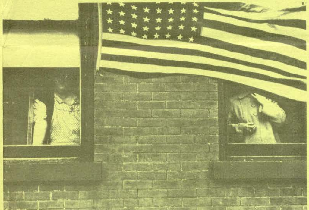
Hoboken 1955 by Robert Frank